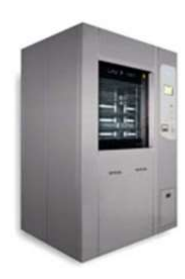
Bedpan Washers& Sterilizers