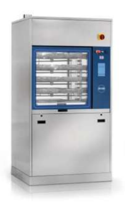
Cleaning & Disinfecting Equipment